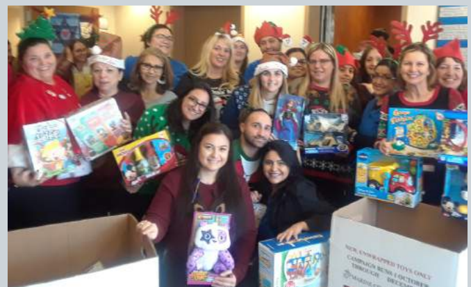
Orthopedic Staff at 3333 Hylan Boulevard Toys for Tots Donation